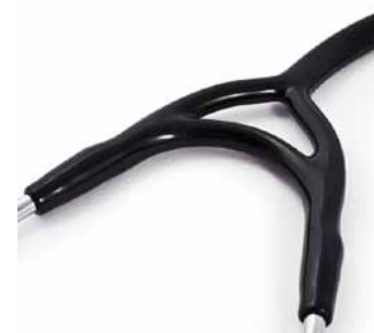
Thanks to the spring integrated in the tube, acoustic signals are conducted from the bell to the ear with virtually no loss.