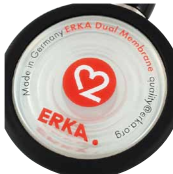
The floating membrane prevents sound transmission at deformation. A ring as protection against cold improves patient comfort and protects the membrane.