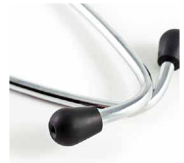
The ergonomically shaped, super soft ear buds offer a good fit for enhanced wearer comfort and prevent acoustic loss. Naturally, the soft ear buds shown are also included as an alternative.