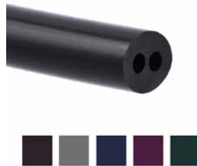
Two parallel interior channels run inside the preformed tube – available in numerous different colours. This avoids friction noise which occurs when two separate tubes are used. Close