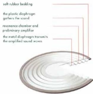
Composition and effect of the patented ERKA Dual Membrane.